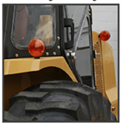
Turn Signal Package