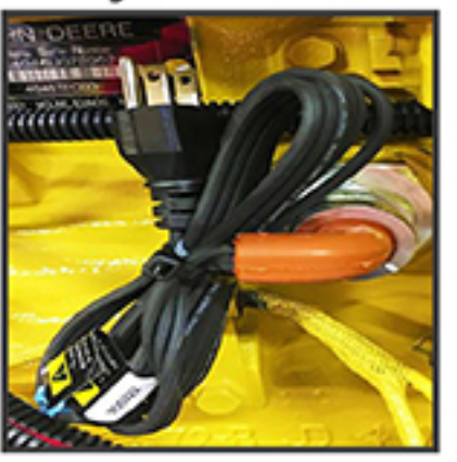
Engine Block Heater