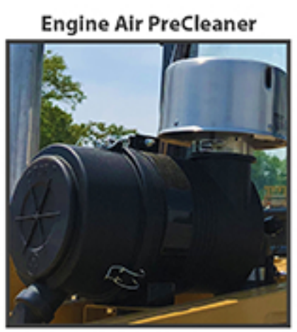
Engine Air PreCleaner