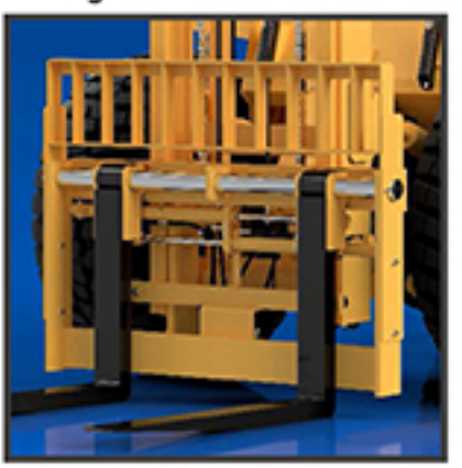
Integrated Fork Positioner