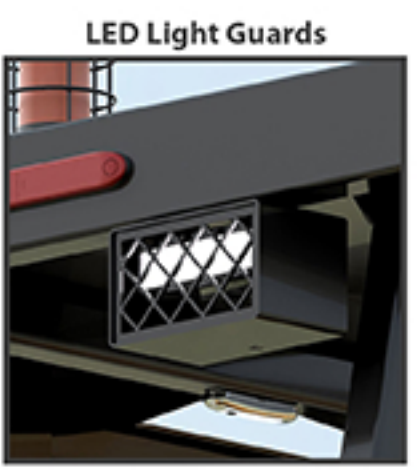
LED Light Guards