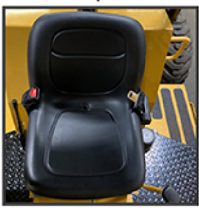
Swivel / Suspension Seat